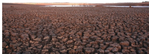
August 2009: Dry lake

The complete failure of the rainy seasons and thus a complete crop failure exacerbate the problem further. Thus, a quick action is essential. The existing in deep layers - high quality water must be made accessible to the population.