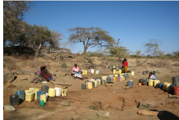
August 2009: Women waiting in front of a water hole